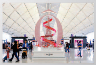
Hong Kong International Airport