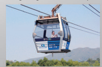
Ngong Ping 360